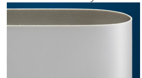
Premium Plus Belt

Fraying / durability test results obtained after identical laboratory tests: