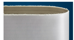
Leading competitor's equivalent belt